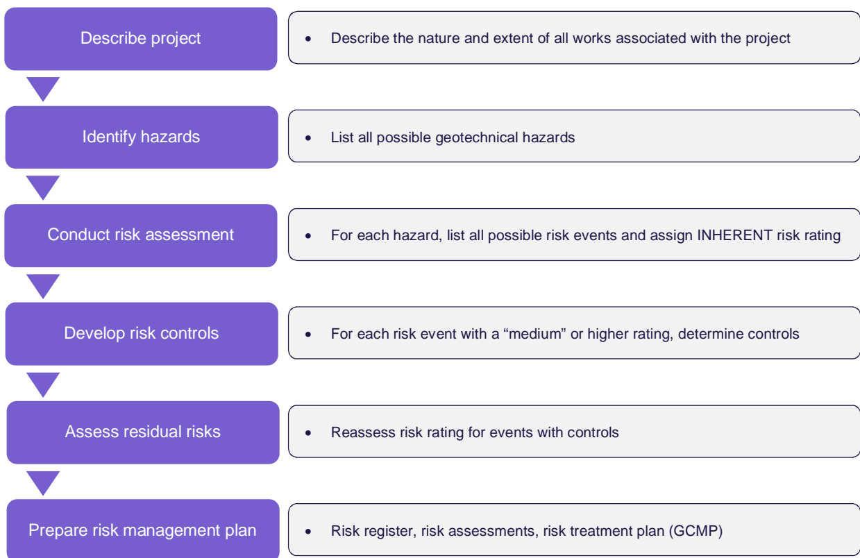
Figure 2: Risk assessment process overview

Geotechnical risk assessment is informed by the geotechnical assessments, described in sections 3.1-3.4. The assessment of geotechnical risks follows the process set out in Appendix A of the Work Plan Guideline (DEDJTR 2018), which is summarised in Figure 2.