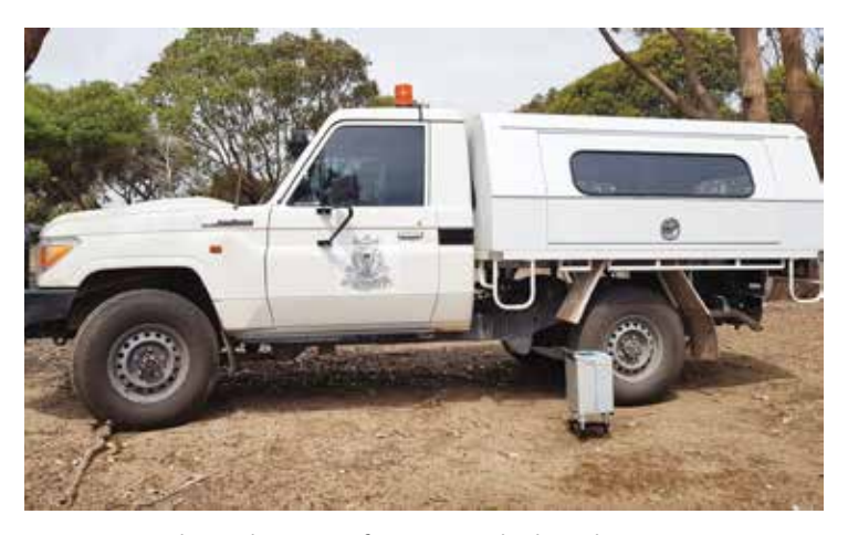
Figure 4. Geological Survey of Victoria vehicle with gravity meter.

Visit Geoscience Australia's Scientific Topics webpage for information on gravity as a geophysical technique www.ga.gov.au/scientific-topics/disciplines/geophysics/gravity