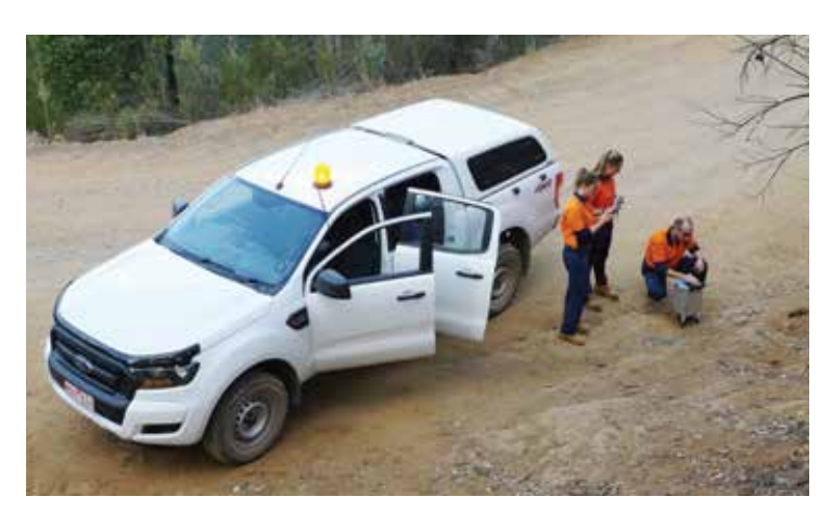
Figure 3. Geological Survey of Victoria gravity survey team near McKillops Bridge, northeastern Victoria.